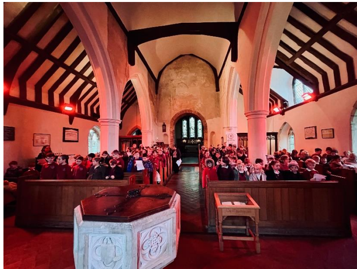
Our Epiphany service on Monday

Happy New Year! We hope you all had a wonderful Christmas and we wish you health and happiness for 2025. It has been lovely to see the children back at school this week. There are a lot of germs going around, so it's important that children are dressed appropriately for the cold weather outside.