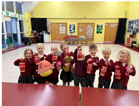
Craft club enjoyed making Chinese lanterns this week

Congratulations to the children who received certificates in Celebration Collective Worship this week