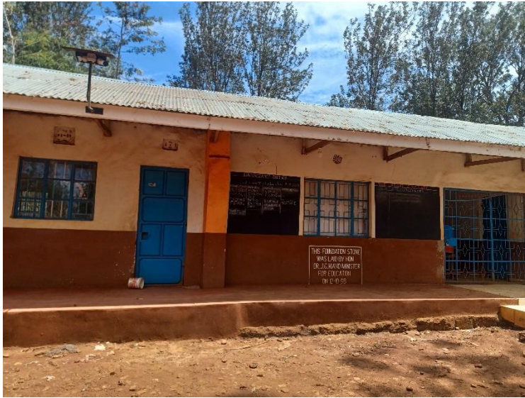
Kagio Primary School staffroom and headteacher's office