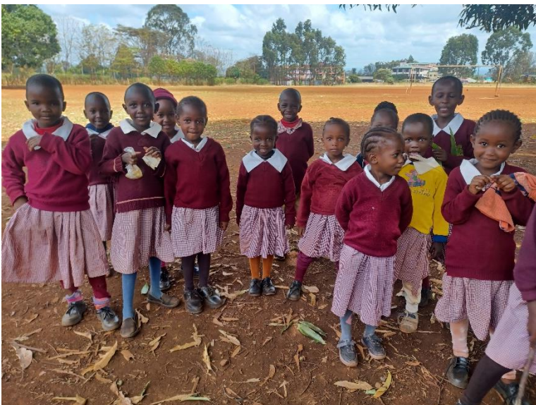
The PP2 Children