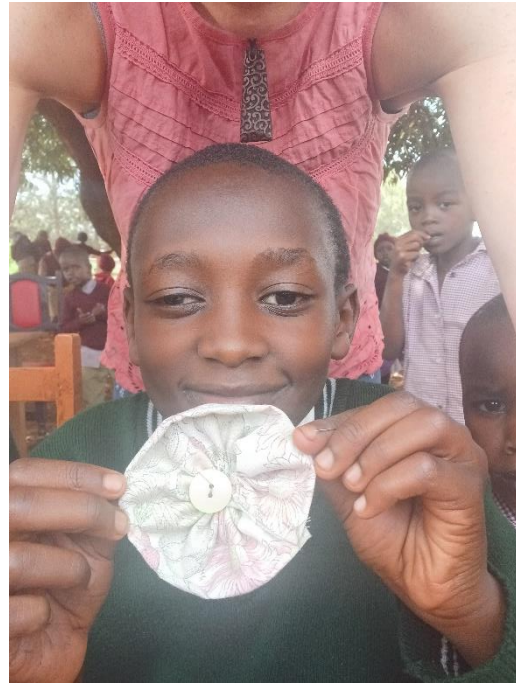
The children sewing their flowers for the LIFE letters