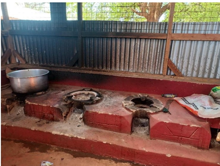
The Kagio kitchen, where the school dinners are cooked