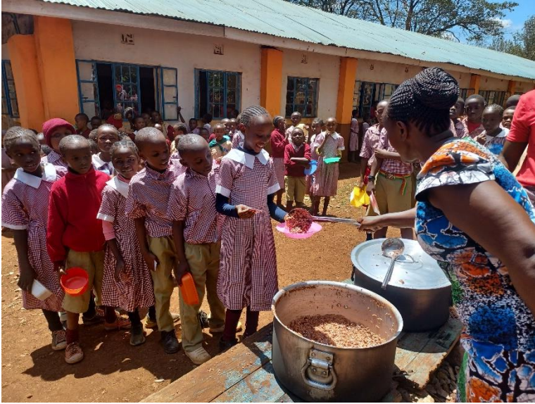
Lunchtime, githeri was on the menu