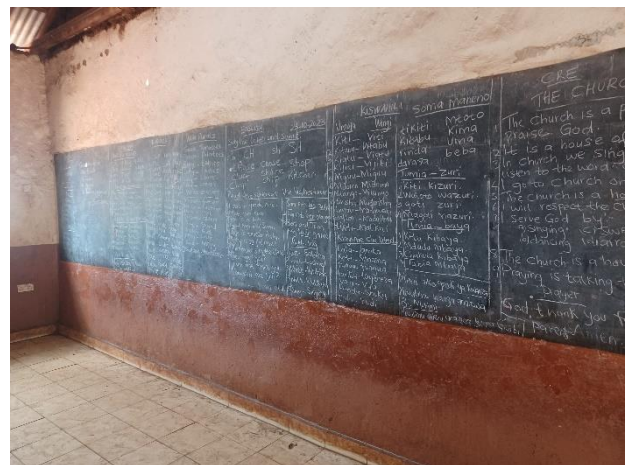
The blackboards in a classroom