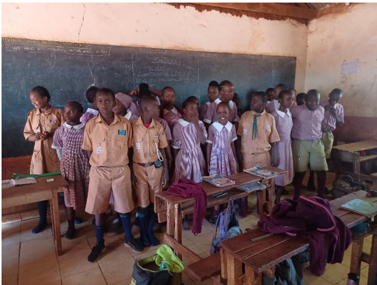
The Grade Eight Children