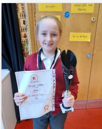
Summer was placed 2 nd in her dance competition.