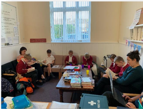
Book Club deeply engrossed in their book!

We also have a prepay option for parents/adults too. This will be £4 and includes a hot dog, beer, mulled wine or a soft drink. Additional refreshments can be purchased with cash on the night.