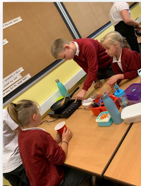
Class Four enjoyed cooking Jollof Rice this week.